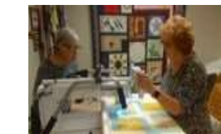
(Click to enlarge)