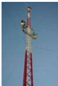
(Click to enlarge)